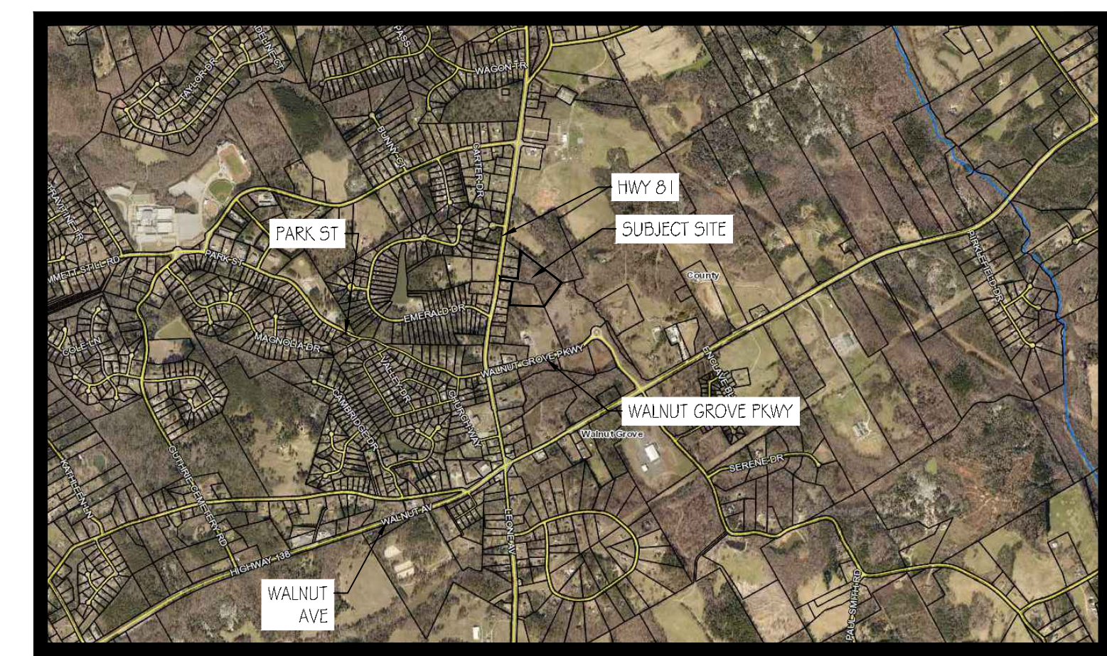
LOCATION MAP nts